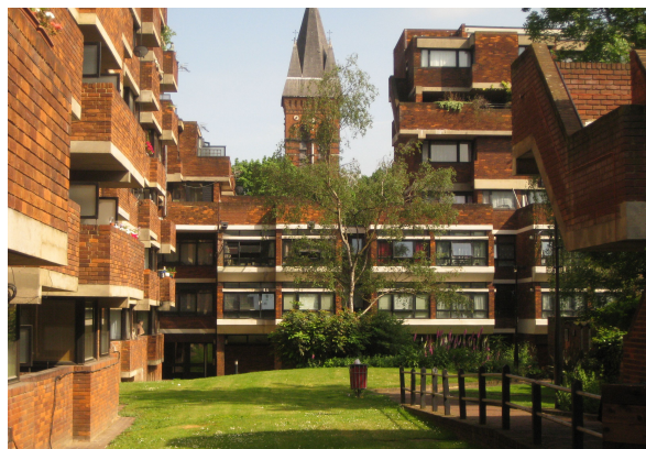
Lillington Street, Westminster, a classic modern movement social housing