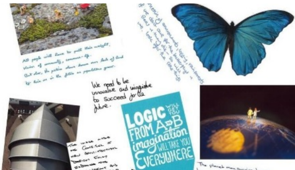
cropped section of Imagining Desirable Futures Poster created by Dr Saratsi