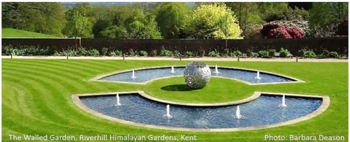
The Walled Garden, Riverhill Himalayan Gardens, Kent

NB Booking closes at 23.00 on Wednesday, 6 March 2024