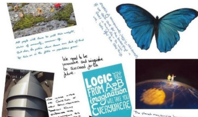
cropped section of Imagining Desirable Futures Poster created by Dr Saratsi

We live in a period of rapid environmental change with potentially great impact on the landscapes where people develop their livelihoods, interact, and shape their cultures. Today's actions to protect the environment are based on perceptions of what could be good or bad in future, beneficial or detrimental, necessary, or excessive. Our visions of future landscapes are inevitably based on past and current experiences, and today's solutions may not have an enduring effect. This talk by Dr Eirini Saratsi considers how our imaginative futures reflect values of care for specific places and considerations of