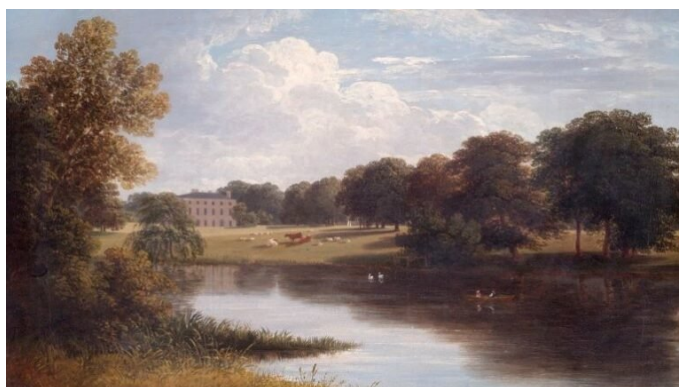
Thomas Christopher Hofland, A view of Whiteknights across the Lake, oil on canvas, c1816, University of Reading Art Collection UAC/10257

The expansion of British Universities in the post war period fuelled the demand for new sites, especially for campus universities. For the University of Reading 'the acquisition of Whiteknights was the most important single event in the history of the University.' Much time and energy has been put into the maintenance of the park. The question remains as to how successfully the historic landscape, dating back to the 18th century, has been preserved in the face of the various demands made upon it. Indeed the survival of the park, a mile from the centre of Reading, is a story in itself given that at various times it was widely regarded as one of the most valuable sites in southern England and 'ripe for development'.