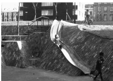
Brunel Estate