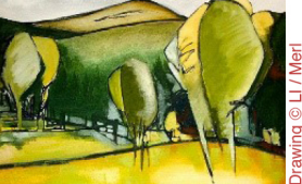
Drawing © L17/Merit

Welcome to FOLAR's October update Bulletin which covers the virtual events jointly with The Gardens Trust this coming this November.